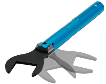
Generic photo used for illustration purposes only